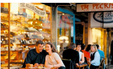
The 'new normal' for pubs, restaurants and cafes in Llangollen?

Comments received both directly to the council and circulated locally on social media groups have highlighted comments from within the Llangollen community that the existing parking bays cause traffic flow issues as pedestrians and cyclists are forced around the cars and into the road at peak times. We would like to take this opportunity to see if the social distancing measures can actually improve traffic, cyclist and pedestrian flows through the town centre.